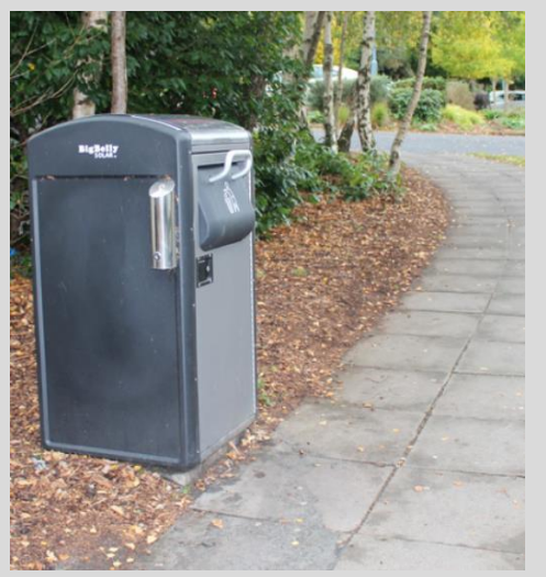
Figure 13.3 - Litter Bin type currently in use in College Green